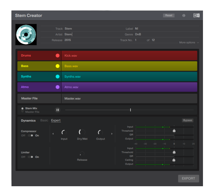
Figure 2. Stem Creator interface.

This is the purpose of the Stem Master Dynamics DSP which is a high-quality stereo Compressor followed by a Limiter. The settings of these dynamic processors can be adjusted in the Stem Creator and are embedded into the Stem file. If the Stem player implemented the Stem Master Dynamics in the signal chain, the parameters can be read from the Stem File and applied to the DSP for optimal audio playback which responds correctly to any changes made to the stem mix by the user.