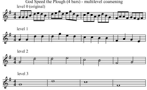
Figure 3. Multilevel coarsening of God Speed the Plough